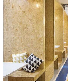
OPEN BOX 1-5