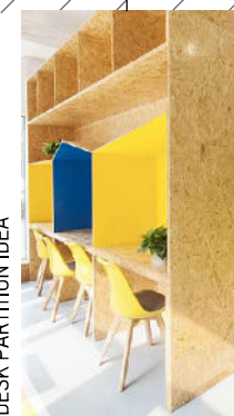
DESK PARTITION IDEA