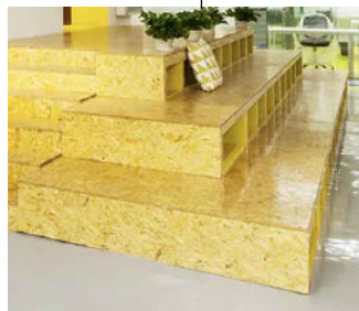
FEATURE STAIRS WITH SEATING & STORAGE OPTIONS